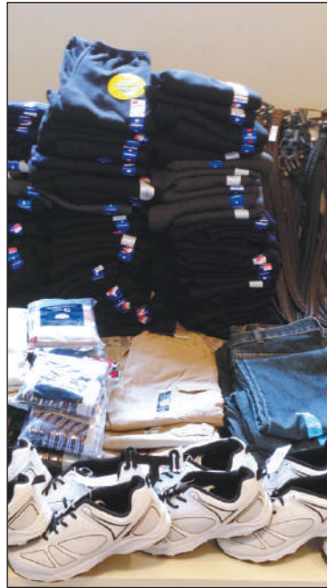
Clothing Our Kids volunteers shop sales and stock an inventory of clothes to provide students and nurses in case of accidents or emergency.